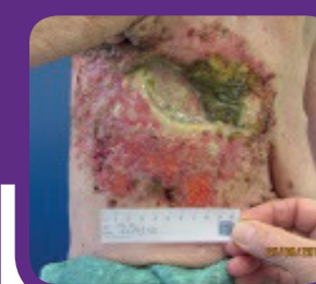
Fungating and/or malodorous

Debride (unless hard Diabetic necrosis) rehydrate eschar